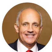
Richard Carmona MD, MPH, FACS 17th Surgeon General of the United States and GWI Board Member